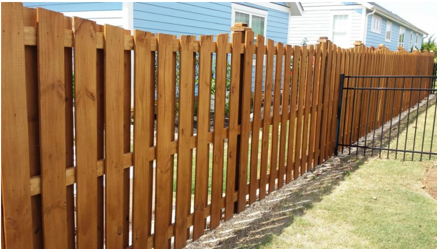
Light walnut, used at 828 Cades Trail