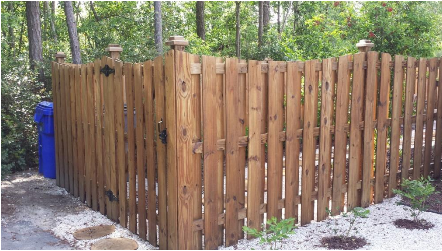
Light oak, used at 440 Lord Charles